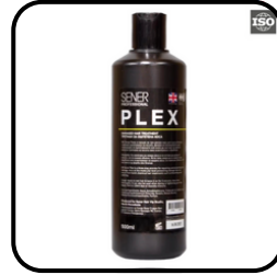
1 x Sener Plex