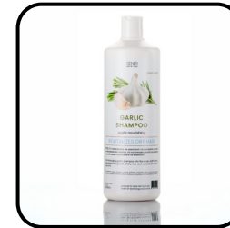
1 x Sener Garlic Shampoo 1L