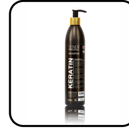
1 x Sener Keratin Shampoo