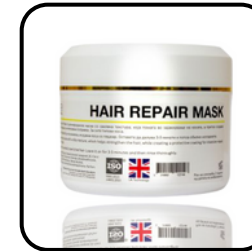
1 x Sener Hair Repair Mask