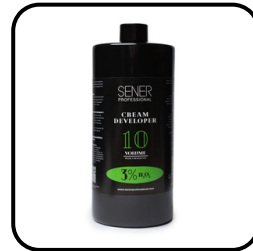
1 x Sener Hydrogen 3%