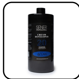
1 x Sener Hydrogen 6%