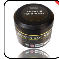
1 x Sener Keratin Mask