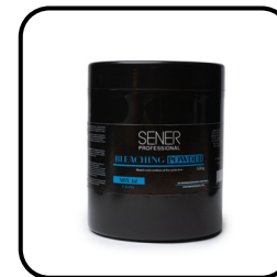
1 x Sener Bleach