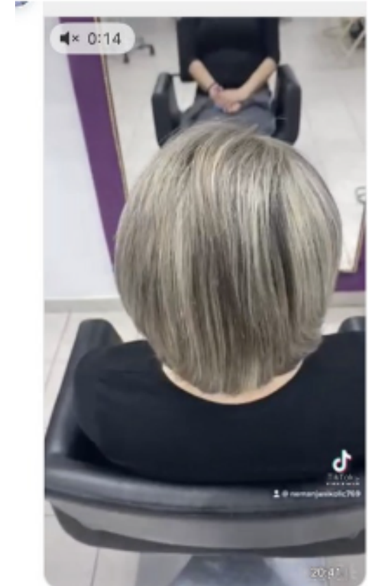
Painted five removed with 4.5% hydrogen. The hair is quite porous, as you can see, but the masterful plex did the job