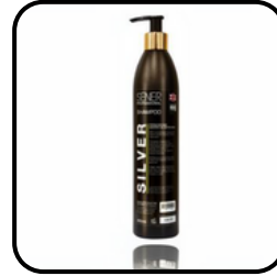
1 x Sener Silver Shampoo