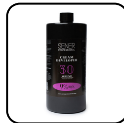
1 x Sener Hydrogen 9%