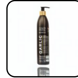
1 x Sener Garlic Shampoo