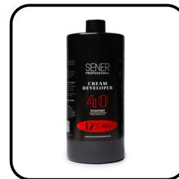
1 x Sener Hydrogen 12%