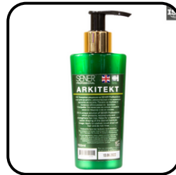
1 x Sener ARKITEKT