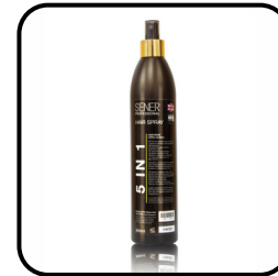
1 x Sener Spray 5in1