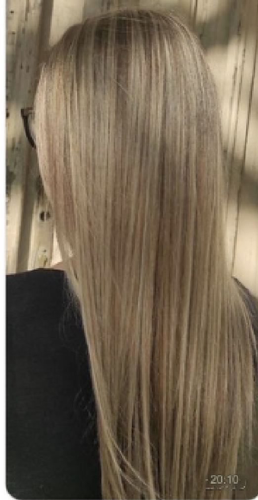
Color and plex works wonders

k2crystal_hair.belgrade I used Plex on a girl who has a lot of chronic diseases and takes medications that dry out her hair. She is very satisfied with the result.